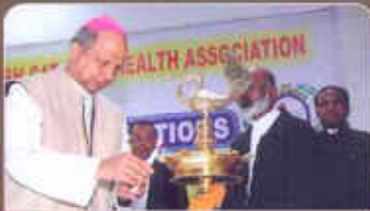
The General Archbishop And Canon Inaugurate the Silver Jubilee Celebration of RUPCHA