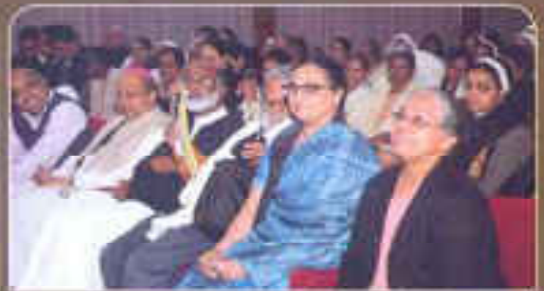
A view of Dignitaries and Participants of Silver Jubilee Celebration