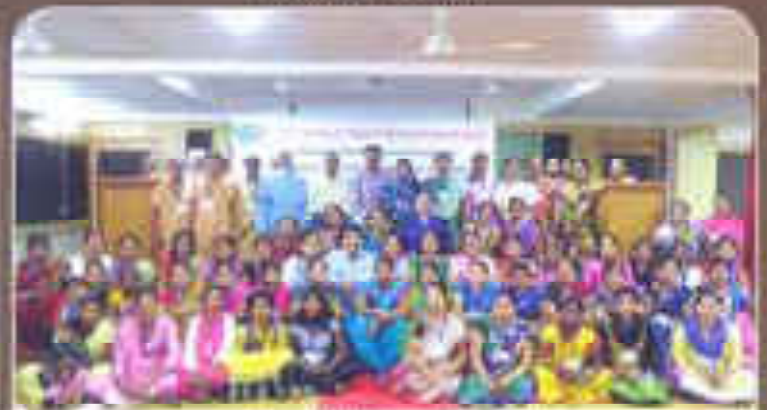
A view of the participants of the training program